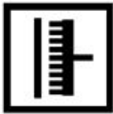
paste the wall

Our coated non-woven wallpapers and vinyls are all “spongeable”. Un-coated papers and specials such as Grasscloth and Silk wallcoverings should be cleaned by dusting with a clean dry brush or by brush accessory on a vacuum cleaner.